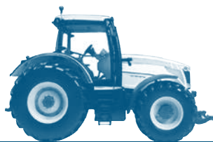
Tractor. Tractor. Tracteur.