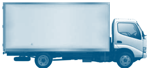
Truck / Lorry. Camión. Camion.