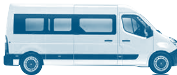
Minibus / Bus / Coach. Microbus / Autobús. Autobus / Autocar.