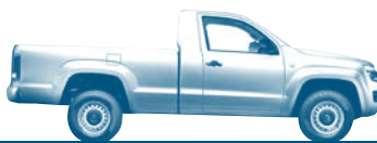
Open Off-Road / Pick-up truck. Todo terreno abierta / Pick-up. Tout terrain à crosserie ouverte.